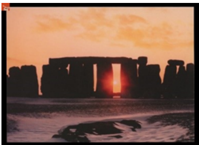
This picture shows Stonehenge. It is thought to have been placed to show the sun on its shortest day. Today, Stonehenge attracts thousands of visitors to dance, and sing on Winter Solstice.

Winter Solstice is the shortest day and longest night of the year. Where we live, it falls on December 21 or 22 every year. Across the world, people have held festivals celebrating the heat, light, and the returning sun that helps plants grow, like those we grow for food.